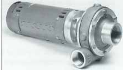
3648H Pump and Hydraulic Motor